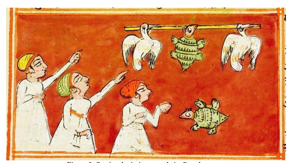
Figure 3: Stories depicting morals in Panchatantra

Indian folklore, much of which has yet to be printed, remains a curious mixture of tradition and pure fantasy. Stories of ogres, ghosts, restless spirits, and other such representatives of the underworld as Yama the God of Death, and holy sages, "rishis," and