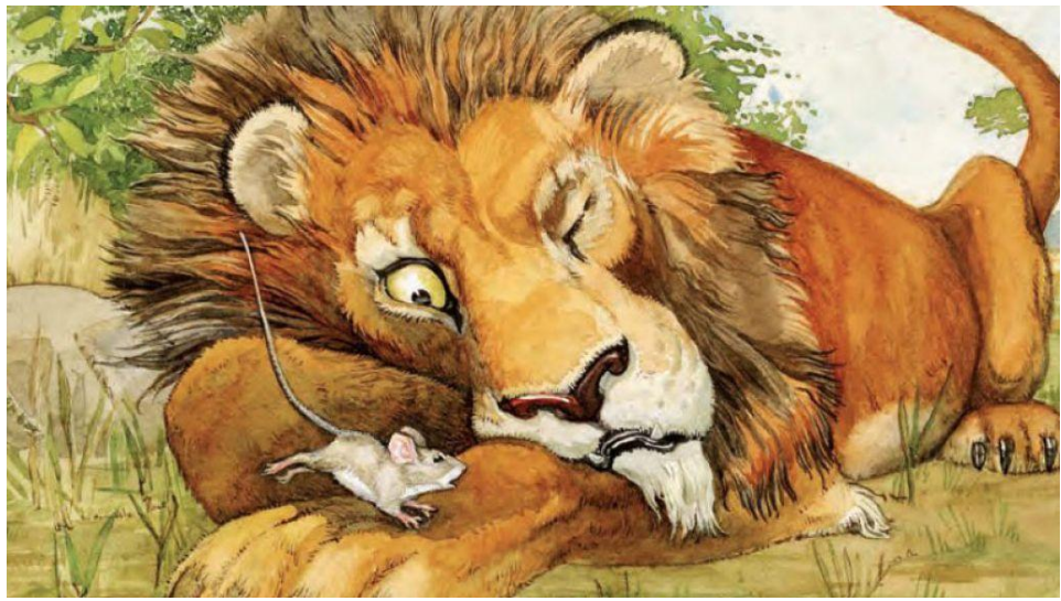
Figure 3: There are more of fables

but sometimes with the hope of appealing to a mixed-age audience. These modern fables can be much grander affairs that the short, allegorical animal stories that first defined the genre. They are often novel-length, with many characters and intricate plots, like Robert O'Brien's Mrs. Frisby and the Rats of NIMH (1971). They can have complicated themes