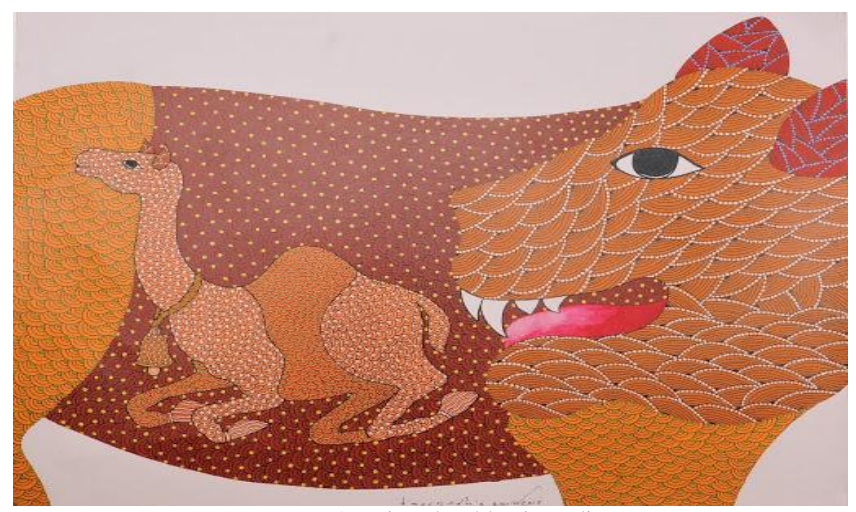
Figure 1: Painted Fables in India

But most feature animals as their main characters, representing human beings, or perhaps particular types of people or kinds of behaviour. In these 'beast fables' the animals are generally fairly lifelike – except that they can often talk – and they do not usually encounter humans. This distinguishes them from animals in