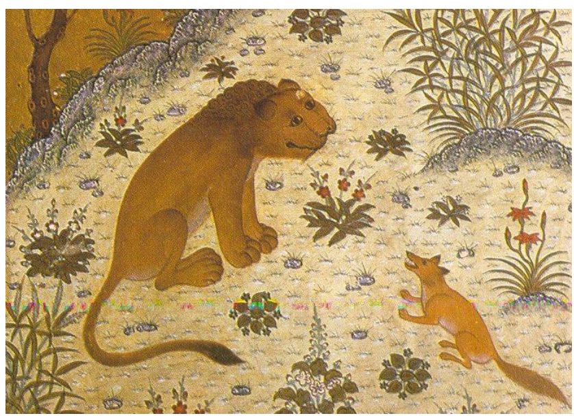
Figure 2: The Panchatantra as a 'Nitishastra' in India

unusual to find a clever quail, an intelligent crow, a smart jackal, or a stupid tiger; the owl is regarded as an ill omen, but not the raven; the peacock, far from being vain, is said to weep because he has such ugly feet, and the snake is not considered dangerous and vile but a protector of the innocent. These fables are retold in many languages and are universal to the country's multilingual literature.